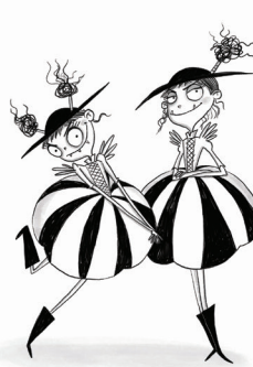
MILLY AND MOLLY